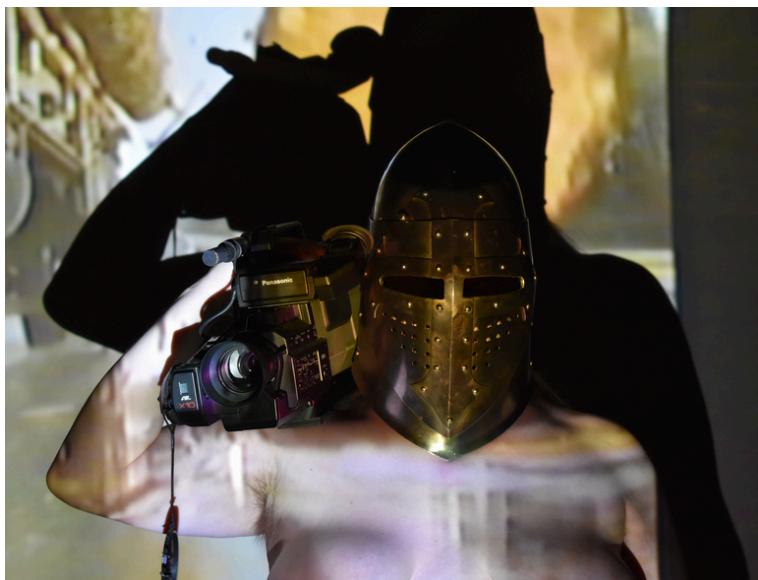
PRINCESS DASHA, 'FINAL DESTINATION GIRL', 2025.

true crime documentary about demonic warfare, sending emails to your childhood art teacher, and Final Destination 2.