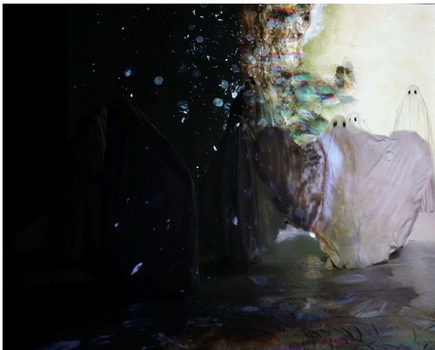
"How to Raise a Ghost" (2023)