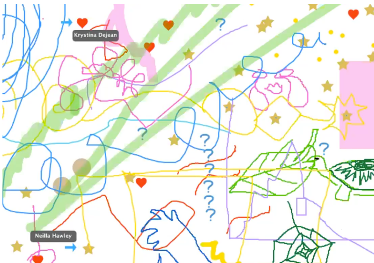
Image: Screen capture of participant's collaborative Zoom doodle pad drawing from Kate Sjoberg's online essay presentation at the Endnote Roundtable Discussion as a part of the spring 2021 Reserach Series.

ID: Zoom doodle pad with colourful squiggles and drawings including a hand, a turtle, a leaf, question marks, stars and hearts.