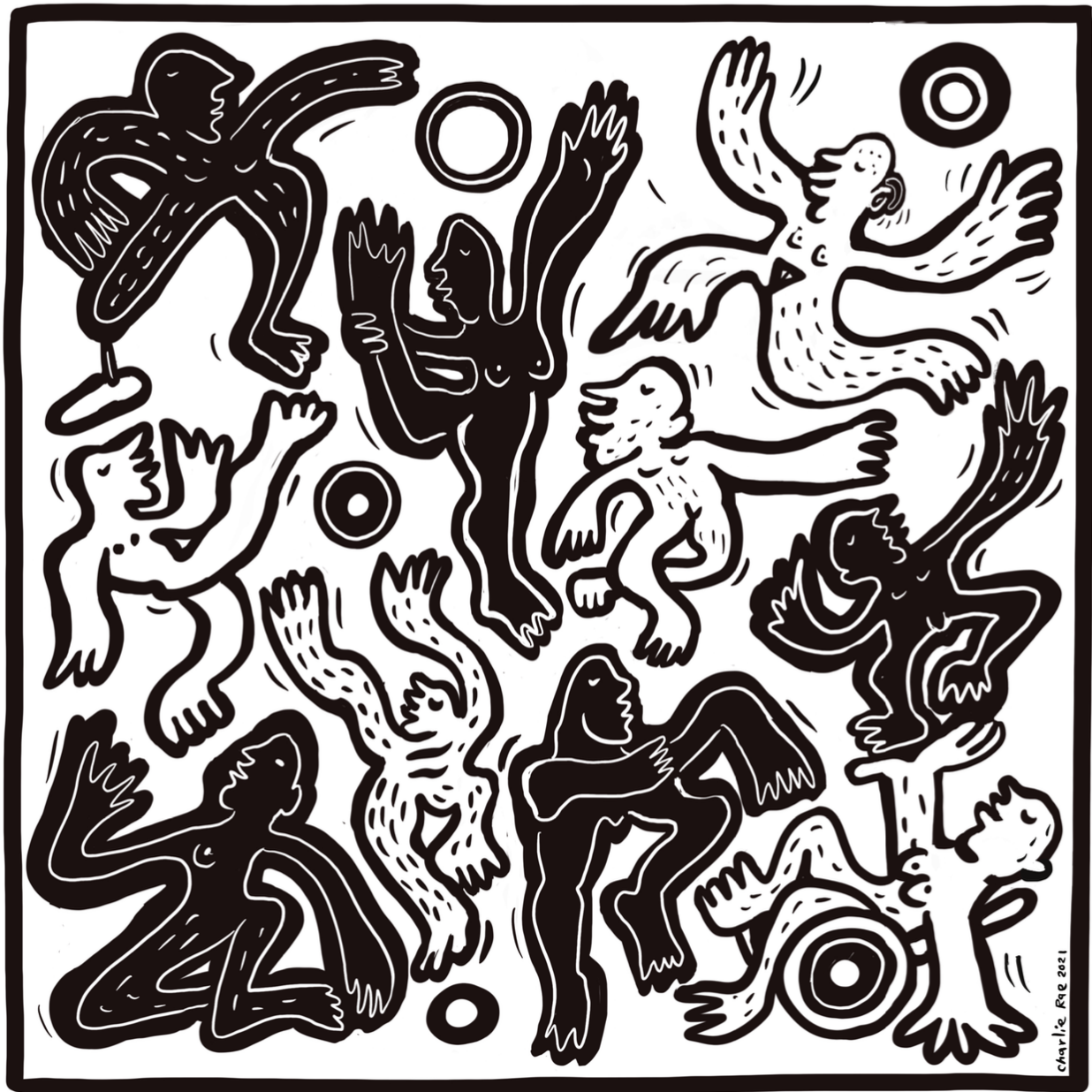
Image: Original artwork by Charlie Rae Walker commissioned by YLDE for our spring 2021 tote bag fundraiser ID: Black and white image of human bodies dancing and moving