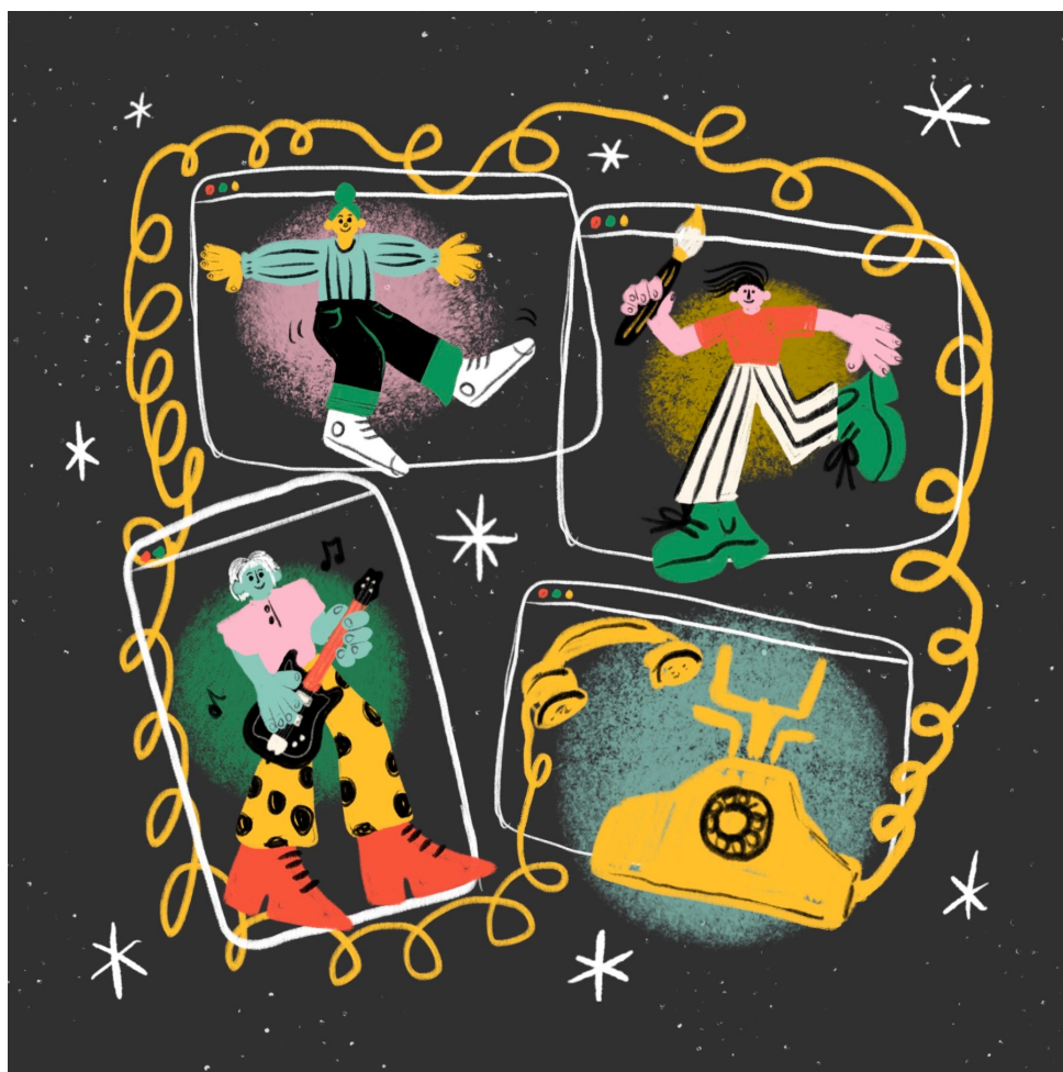
Image: Graphic design by Talia Steele for the Manitoba Yellow Pages: A Scorebook for Movement and Sound - Telephone Game B ID: four cartoon images in square like shapes, a human dancing, a human playing guitar, a human holding a light/torch, and a telephone.

Throughout the year, YLDE continued to correspond with our mailing list of over 550 contacts, sending out newsletters with our upcoming activities, updates and community events, and boosting our online presence and broadening our social media audience with our online content.