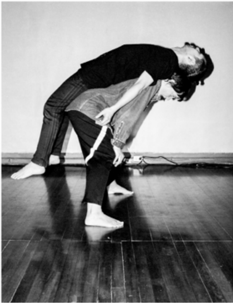
Research Series 2019