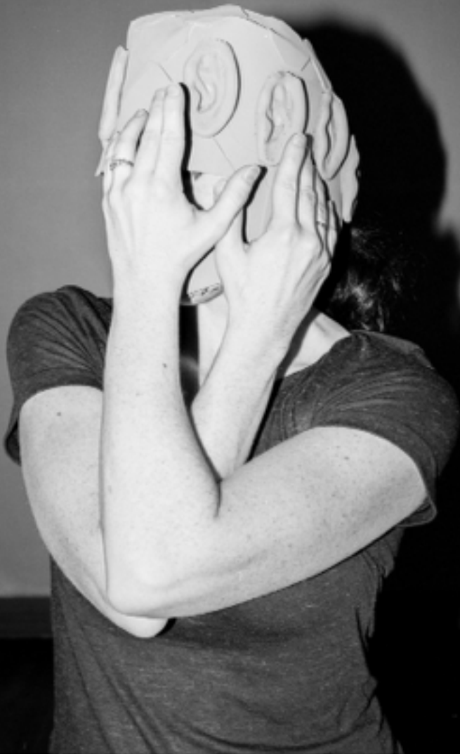
Research Series 2019

Young Lungs offers three streams of programming. The Research Series, which is a juried and paid artist residency opportunity, the Workshop Series which offers multiple workshops open to various skill levels, and professional training opportunities, and Outreach which in our 2018-2019 year largely consisted of free movement practice sessions lead by various community members through year. Young Lungs directly engaged with over 30 artists in the 2018-2019 year through the research series, workshop and movement practice, while serving a larger community of participants and audiences of more than 200 people attending our programming throughout the year and engaging with our e-newsletter.